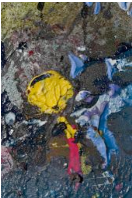
The «Disparus» at Galerie Gourvennec Ogor (Marseille)

He is the President Founder of the association Spirit of Boz, which works for the creation of a collective work and defends contemporary Art in all its forms.